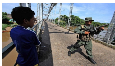
Figure 2. Venezuelan troops close the Venezuela-Colombia border in Boca de Grita, Tachira state, on August 21, 2015