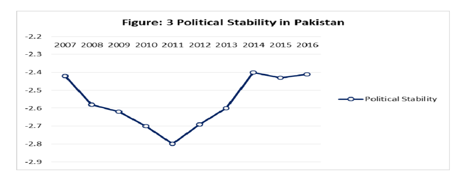
Figure 3 Political stability in Pakistan is in a negative percentage but it is getting better from 2014.